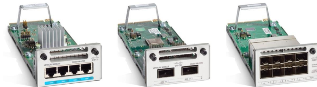
Table 2. Network Module Numbers and Descriptions