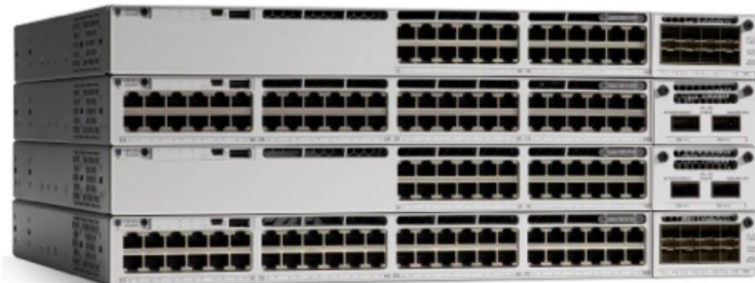
Figure 1. Cisco Catalyst 9300 Series Switches

Table 1 lists port scale and power details for the Cisco Catalyst 9300 Series models.