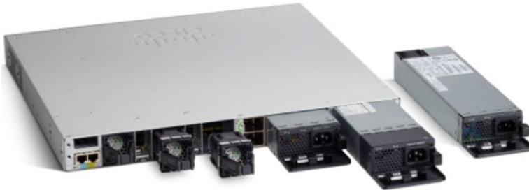
Figure 3. Cisco Catalyst 9300 Series Dual Redundant Power Supplies

Table 3 lists the different power supplies available in these switches and available PoE power.